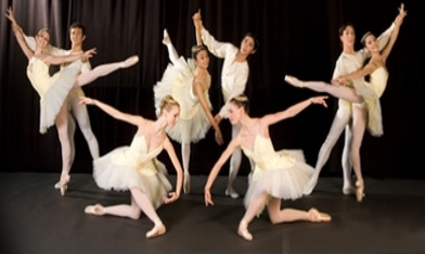
George Balanchine Divertimento No. 15